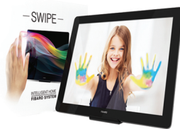
Swipe Gesture Pad